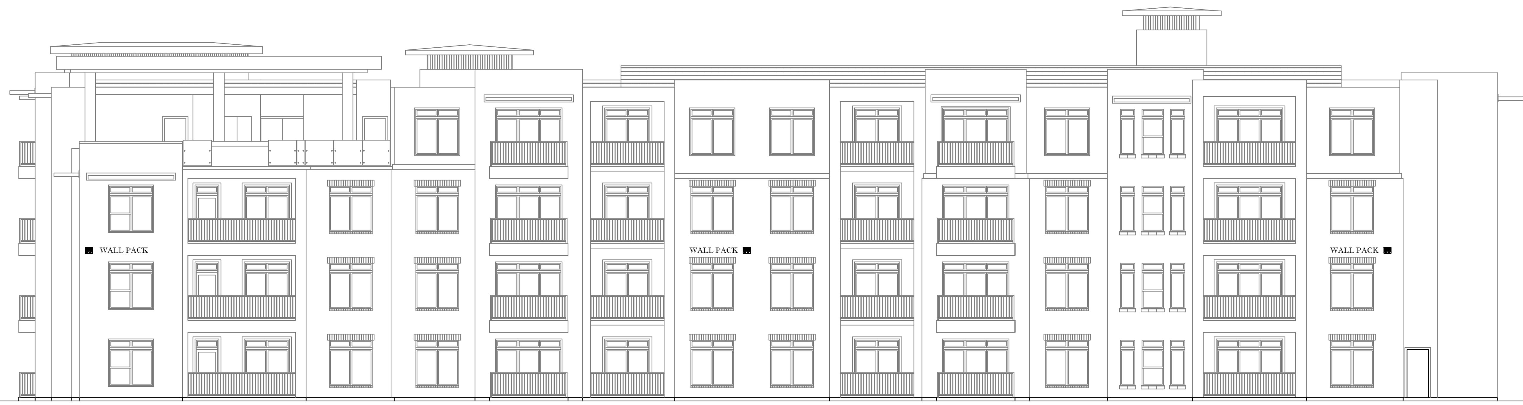
BUILDING 5 FRONT ELEVATION