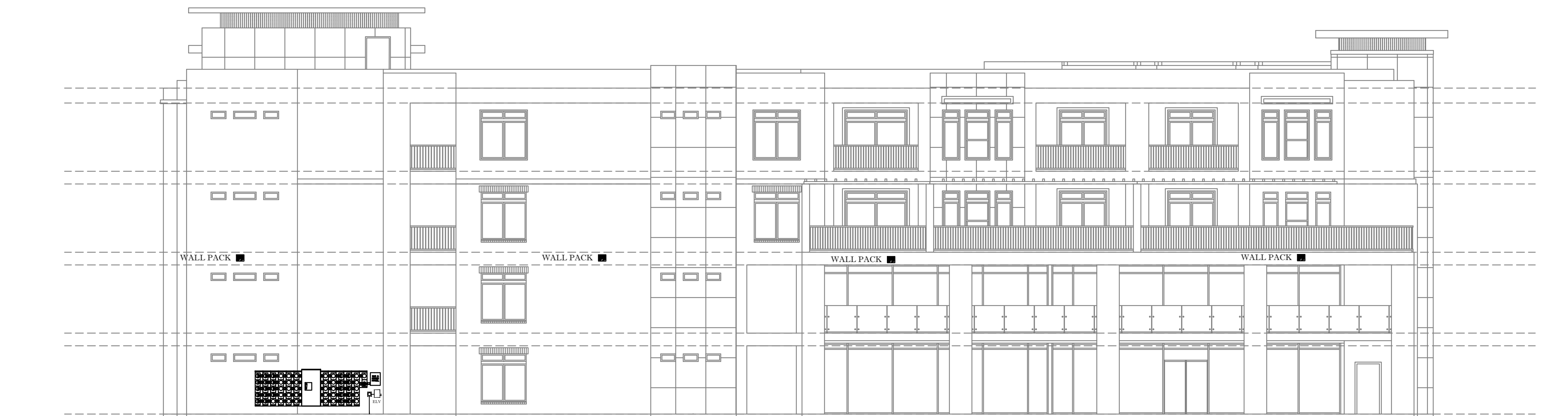
BUILDING 1 REAR ELEVATION