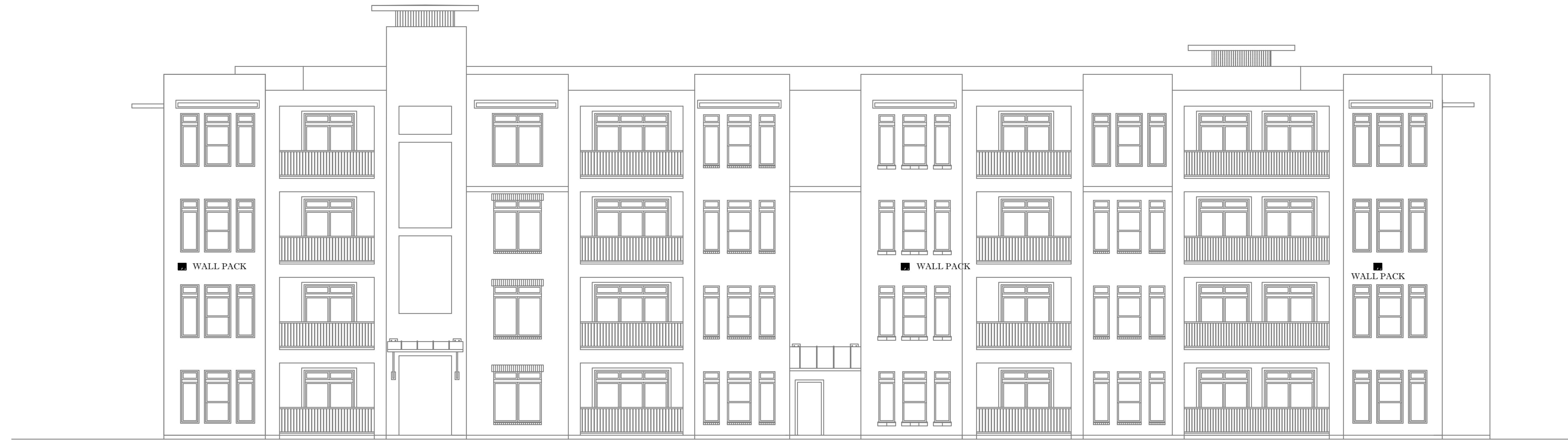
BUILDING 2 FRONT ELEVATION