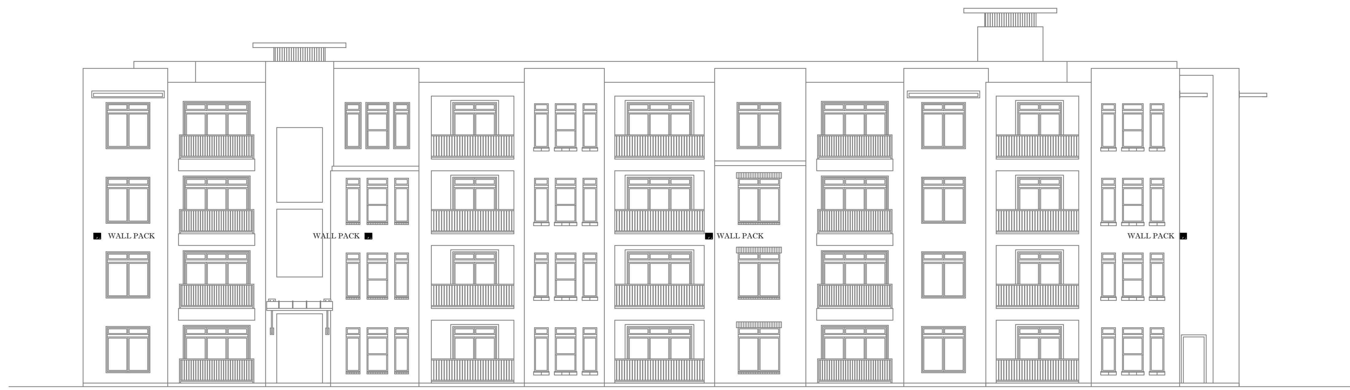
BUILDING 2 REAR ELEVATION