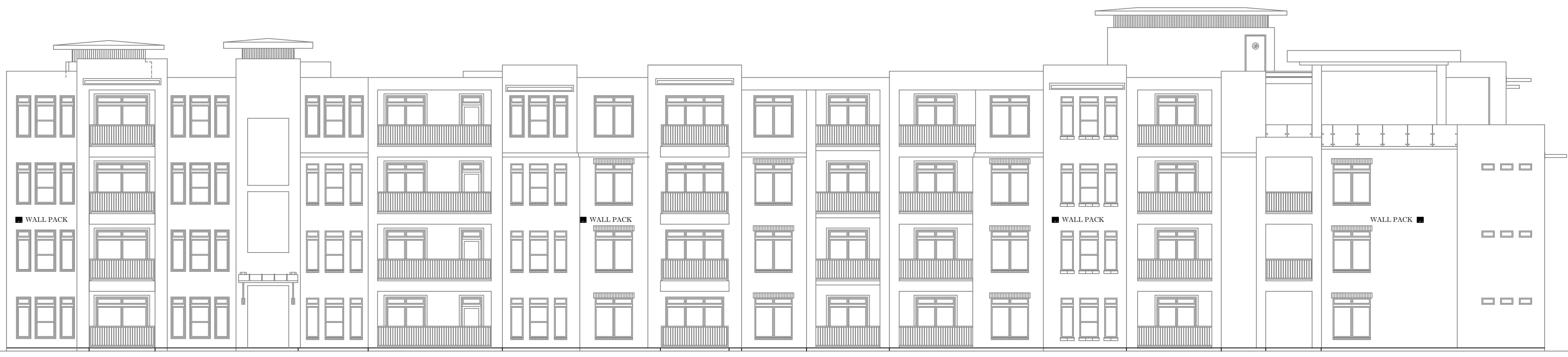
BUILDING 5 LEFT ELEVATION