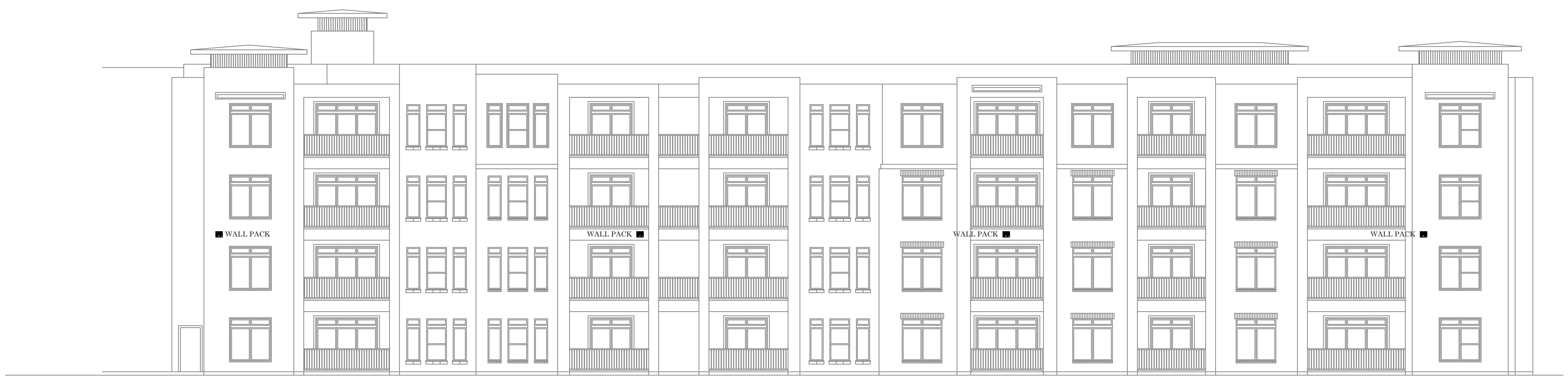
BUILDING 3 FRONT ELEVATION