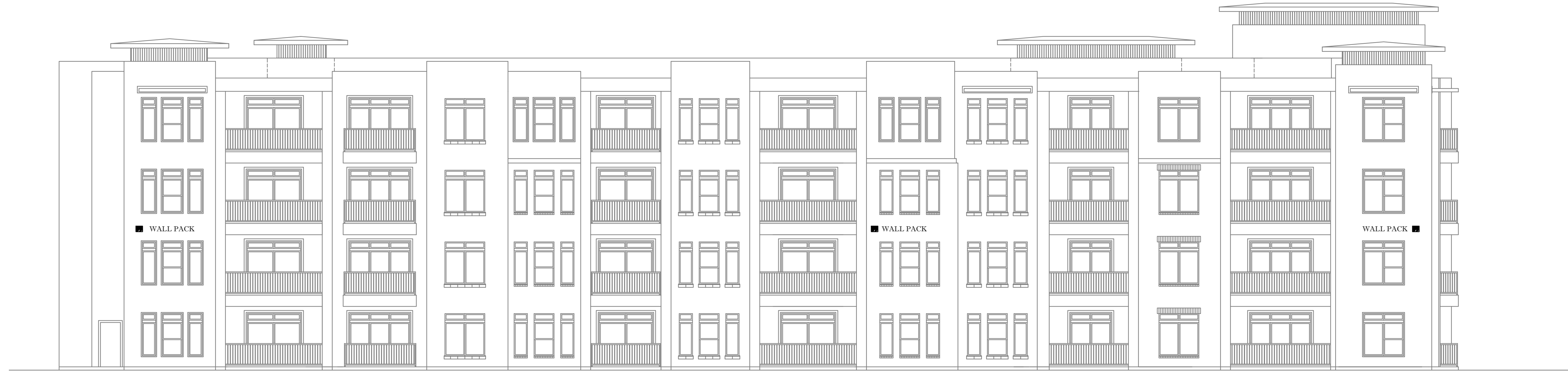
BUILDING 4 FRONT ELEVATION