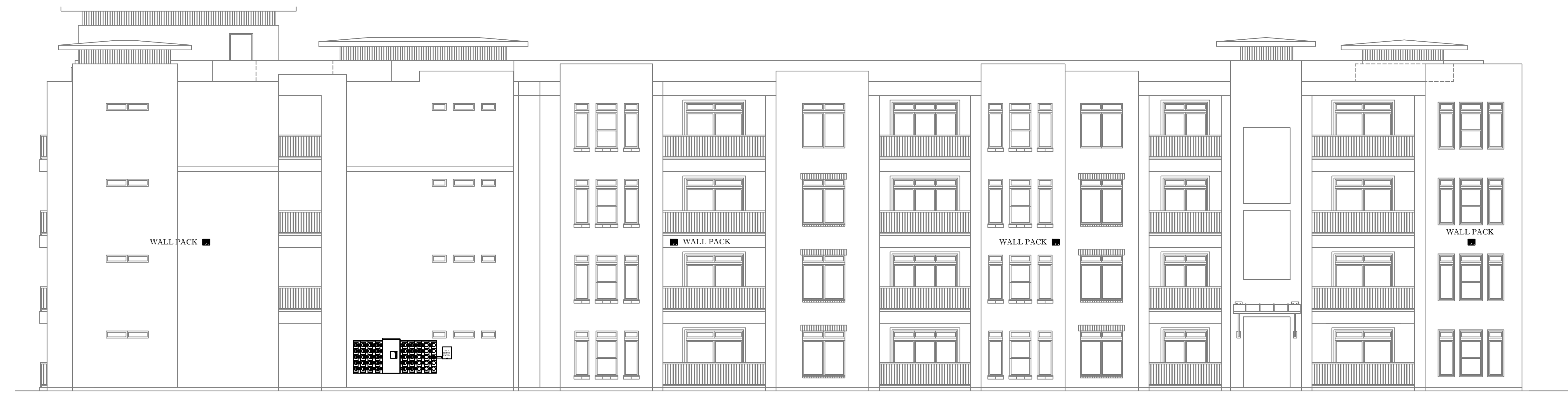
BUILDING 4 REAR ELEVATION