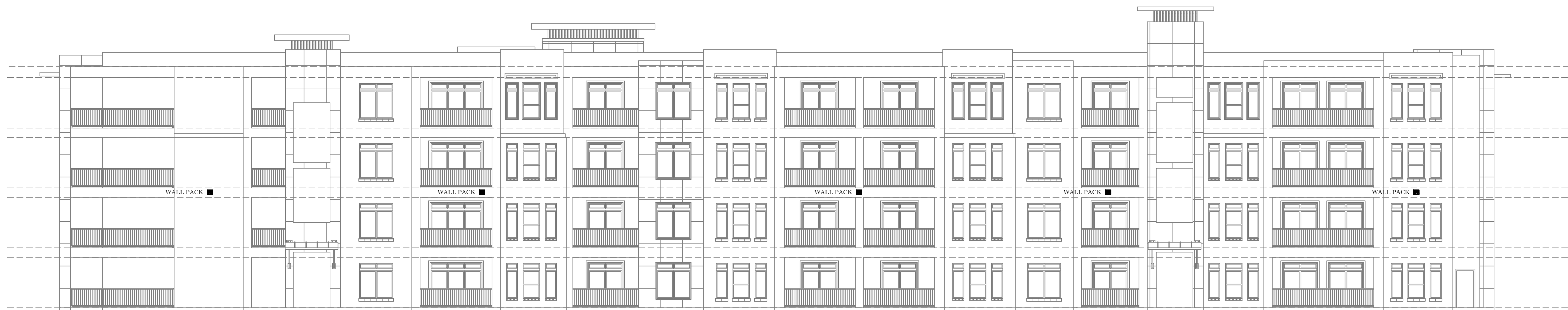
BUILDING 1 RIGHT ELEVATION