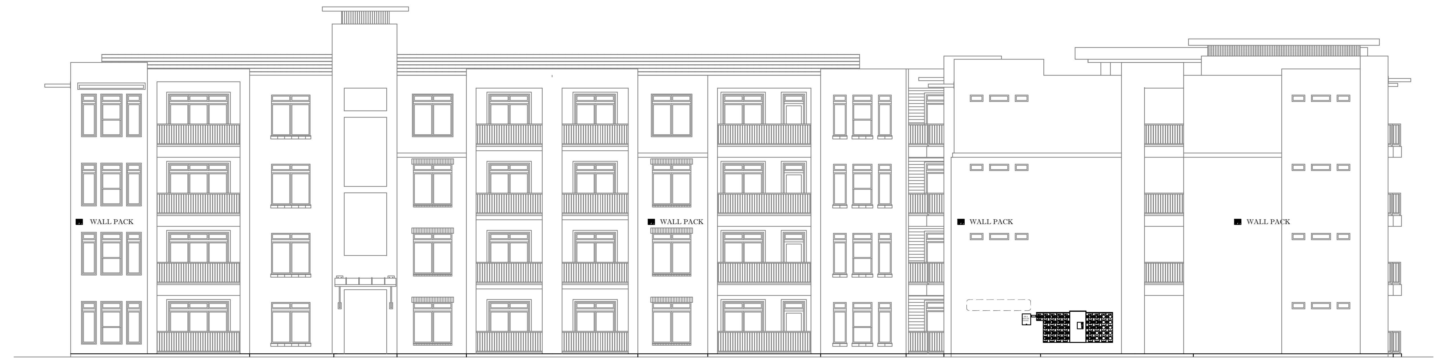
BUILDING 5 REAR ELEVATION