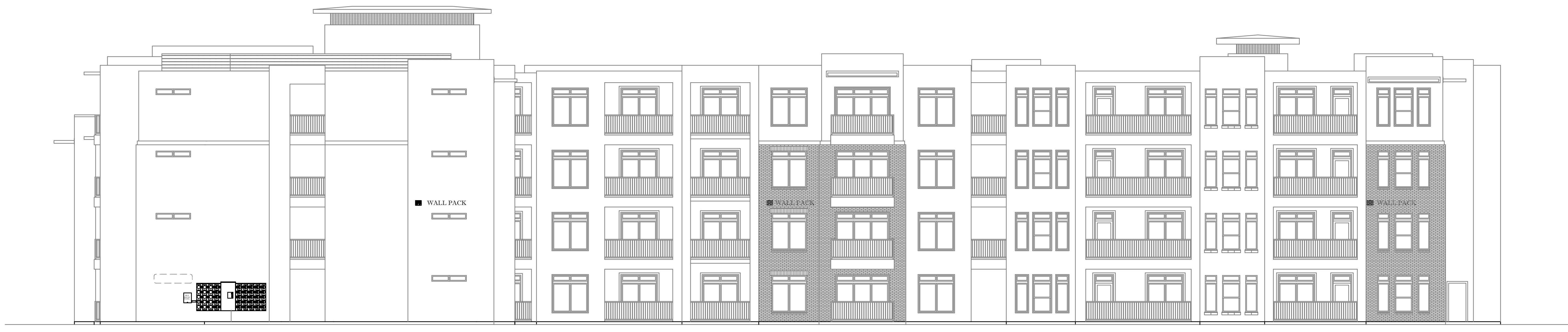
BUILDING 5 RIGHT ELEVATION