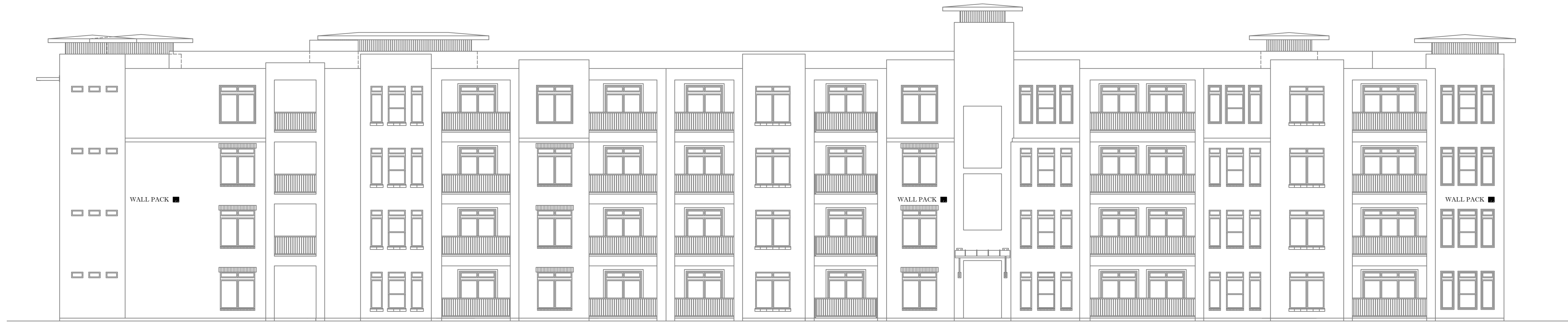
BUILDING 4 RIGHT ELEVATION