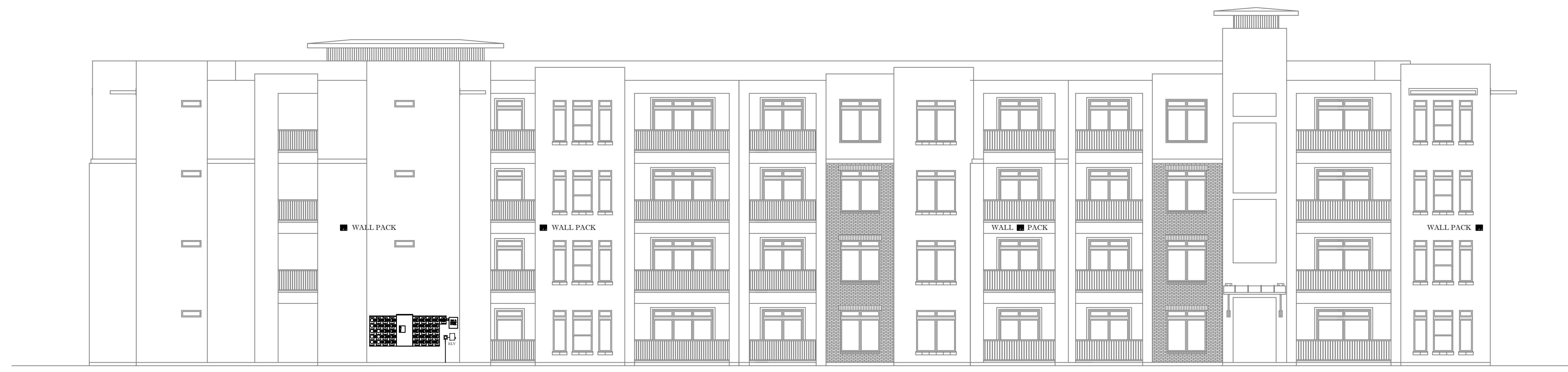
BUILDING 3 REAR ELEVATION