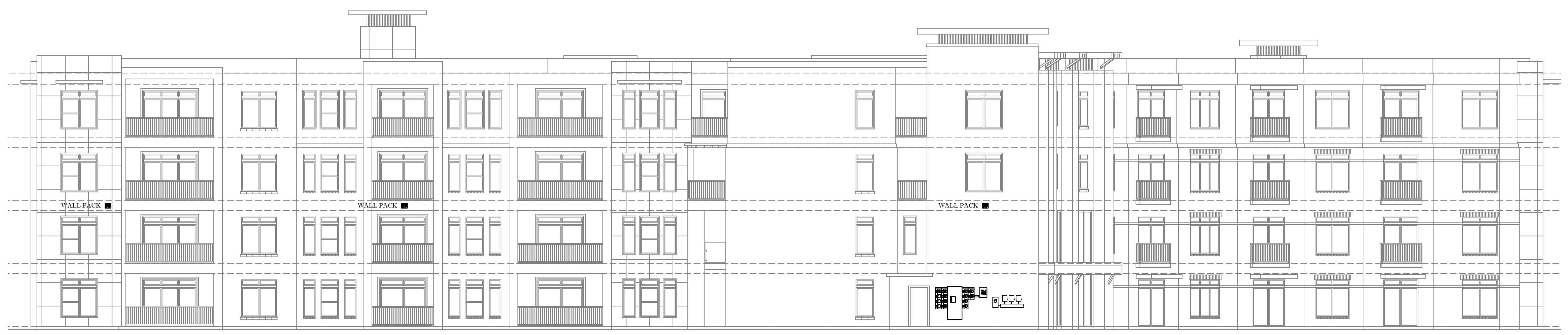
BUILDING 1 LEFT ELEVATION