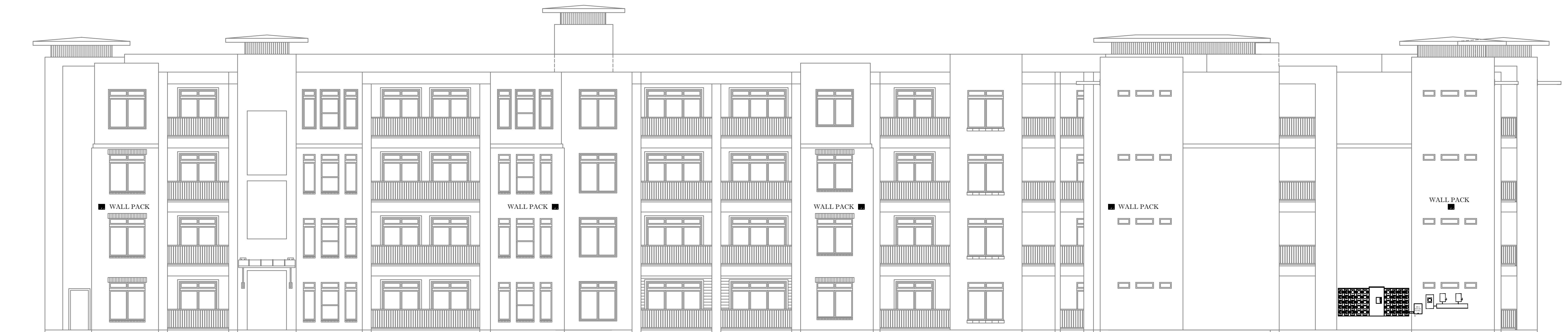
BUILDING 4 LEFT ELEVATION