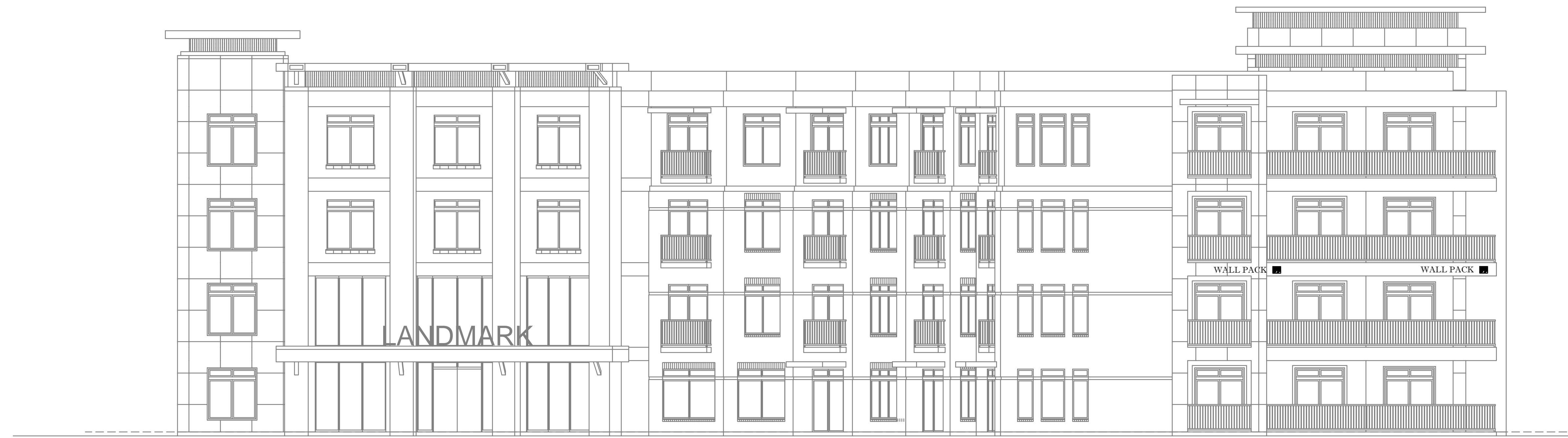
BUILDING 1 FRONT ELEVATION