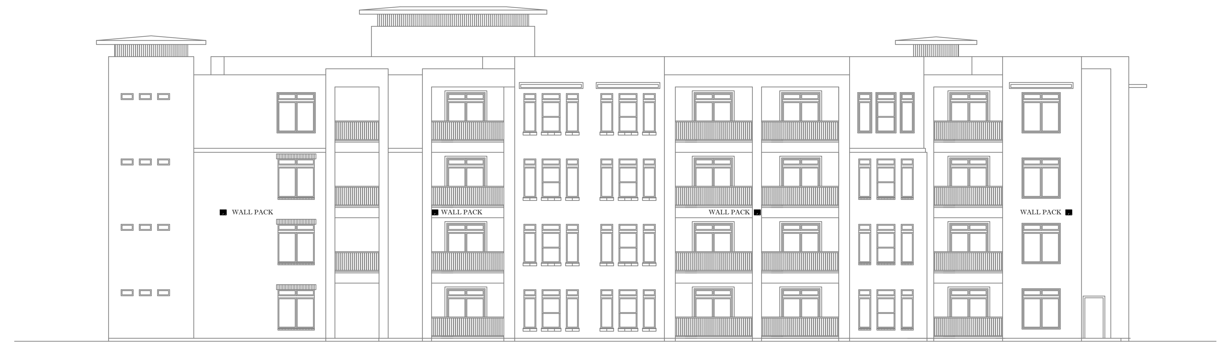
BUILDING 3 RIGHT ELEVATION