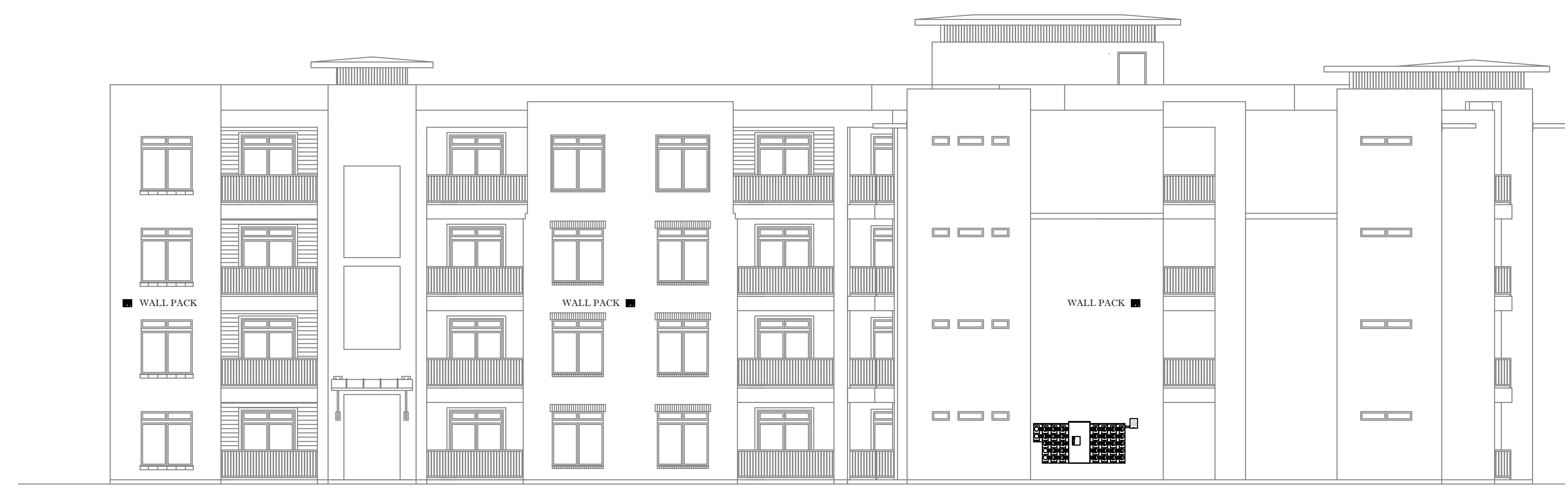
BUILDING 3 LEFT ELEVATION